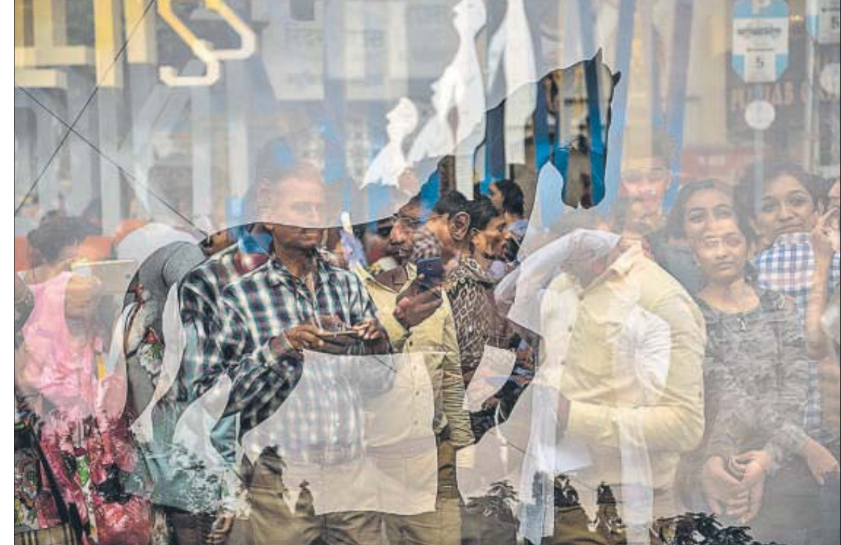
• Understanding art, attending events or to take selfies - the reasons were different, but the sentiment at the HT Kala Ghoda Arts Festival was the same.